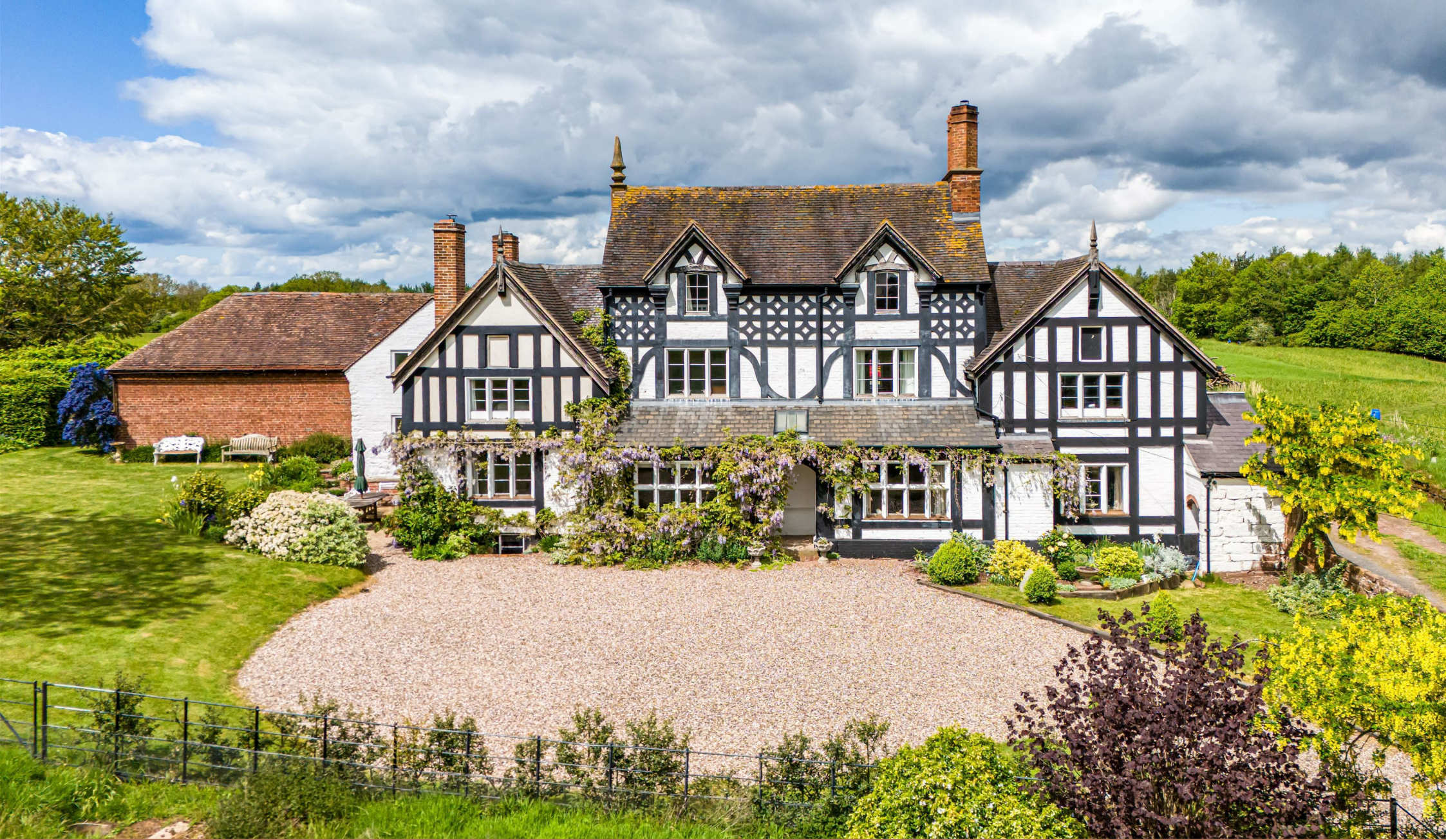
Hopstone House Hopstone, Claverley, Wolverhampton, WV5 7BW